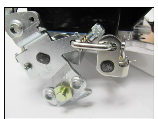
Figure 5 - 700R4