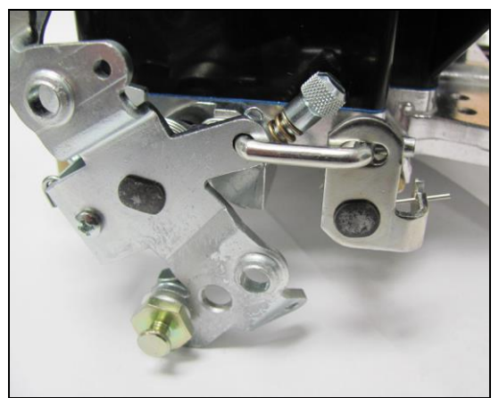
Figure 4 - TH350