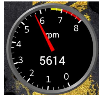
Figure 3 - Silver