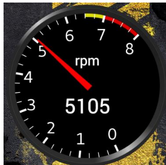
Figure 2 - Black