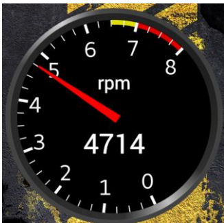
Figure 1 - Grey